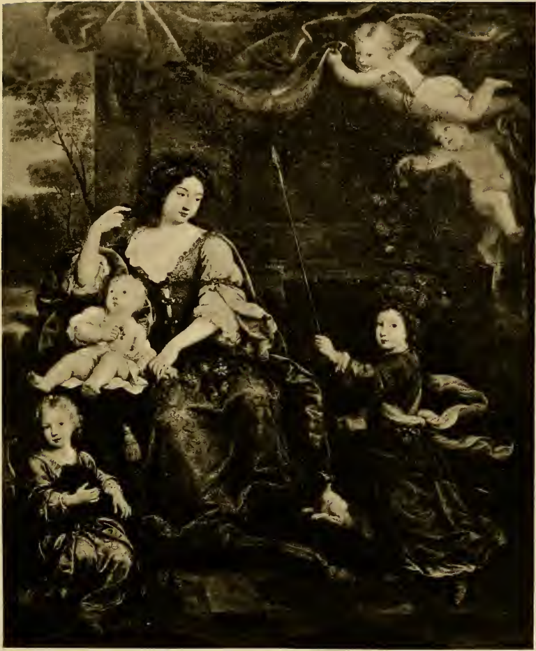
The Dauphine wife of Monseigneur